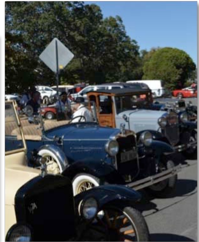
Kent Carruthers sent in this photo from the 2013 Oliver Hardy Festival. Kent brought the car here just in time for the parade.