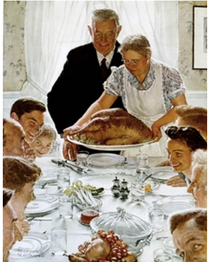
From the March 6, 1943 Issue of The Saturday Evening Post : The Four Freedoms Series

Historically, the defining virtue of the American people has been public gratitude during times of greatest difficulty. It is no wonder that Norman Rockwell's portrait of the Family Thanksgiving Meal was painted in 1943 when food was rationed to support our Troops in WWII. To the best of my knowledge, no