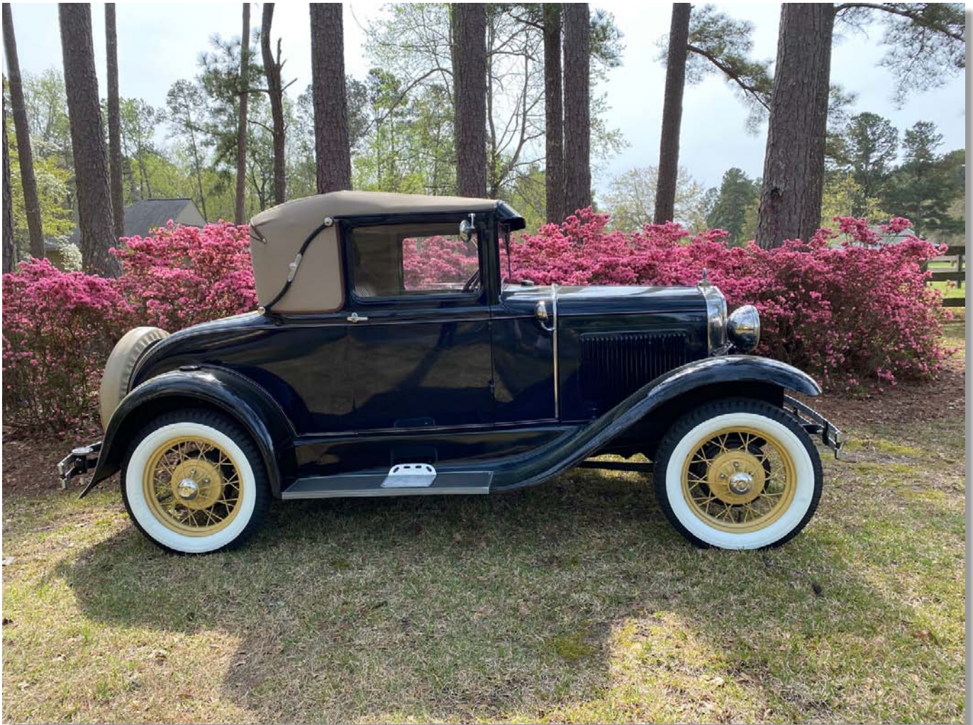
Chris and Caitlin Martin's Sport Coupe shines in front of beautiful pink azaleas in bloom.

The Newsletter editor recently suggested that Shade Tree A's members take advantage of the beautiful springtime weather and flowering trees and shrubs in Augusta and surrounding areas. Members were requested to get their Model A's out and take some photos for the Newsletter. Several members responded with some beautiful photos including the photo on the cover. Enjoy the beautiful photos and if you didn't submit a photo, it's not too late to take a photo of your own to submit for a future Newsletter.