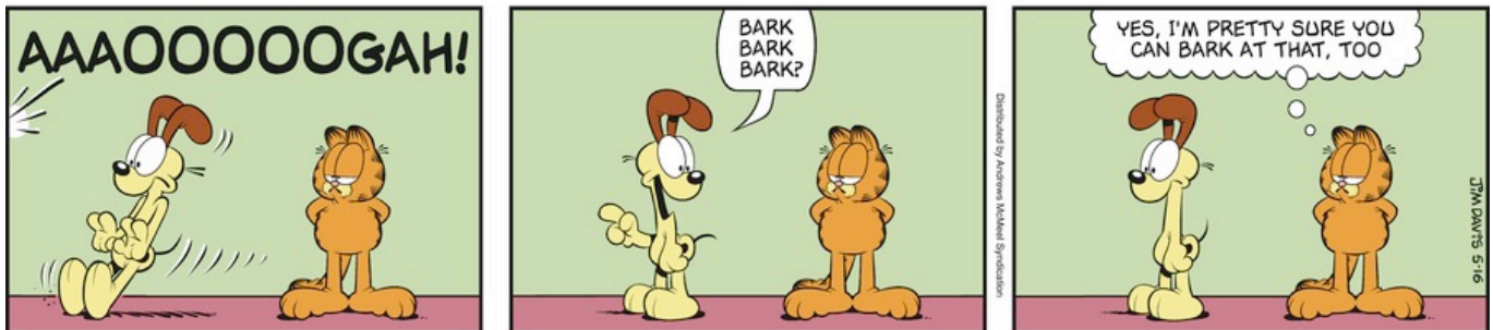
Garfield by Jim Davis for May 16, 2021